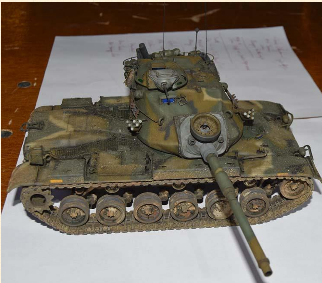
M60-A2 AFV Club with Tamiya stowage set