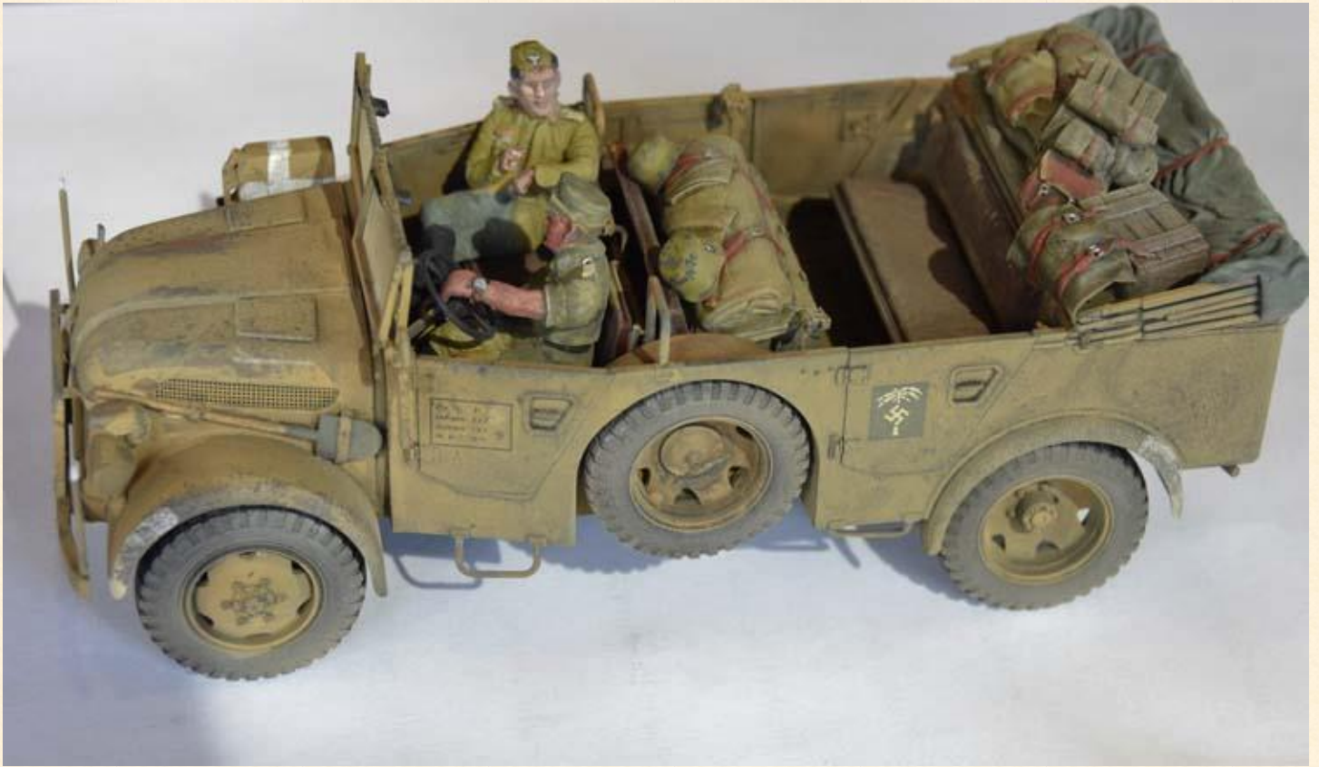
Tamiya Staff car- Styer 1500 A – OOB with value gear and extra figures