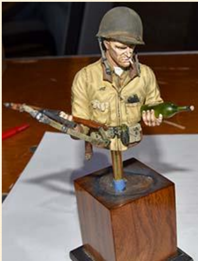
US Infantryman in Italy